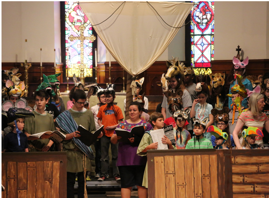
Noah's Flood (Noye's Fludde)