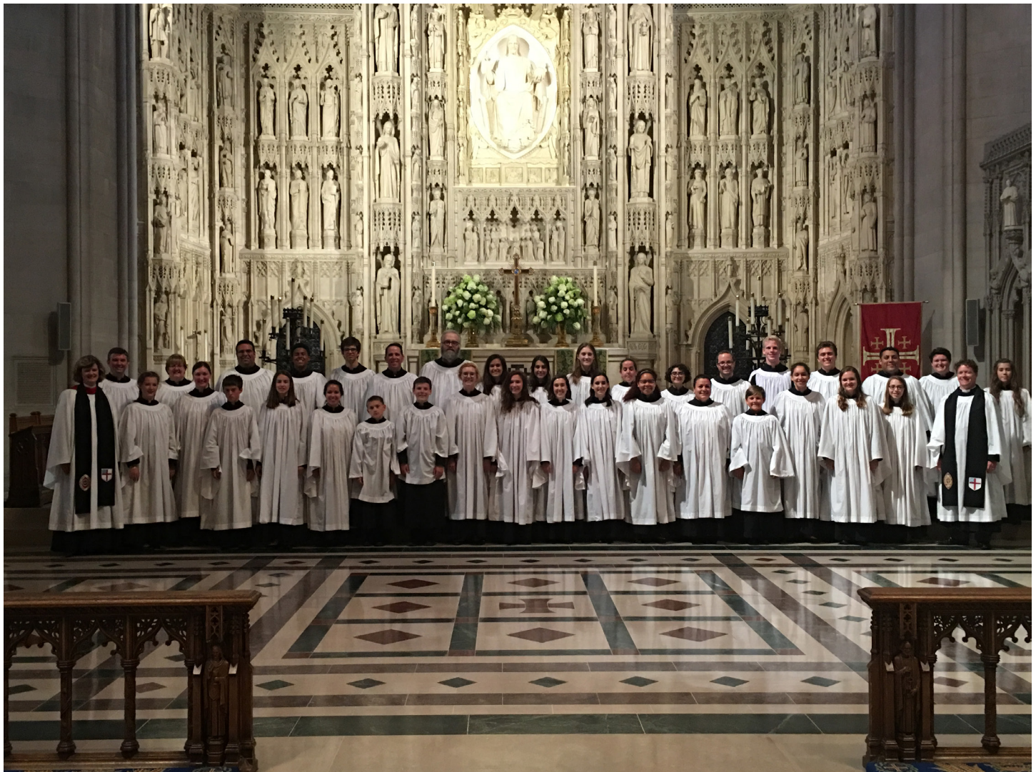
Youth Choir and St. Mark's Choir at the National Cathedral