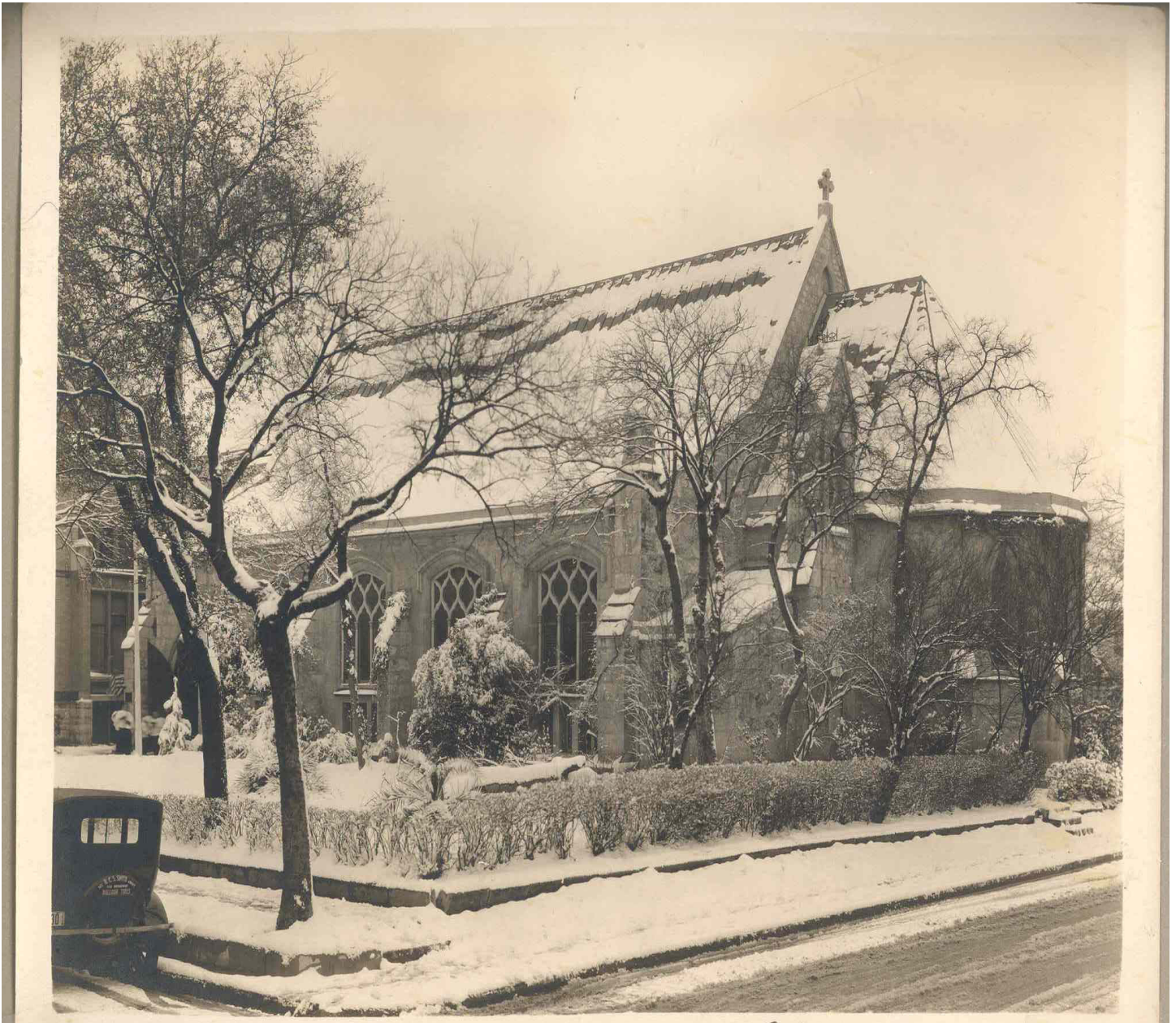
St. Mark's Episcopal Church on March 8, 1915