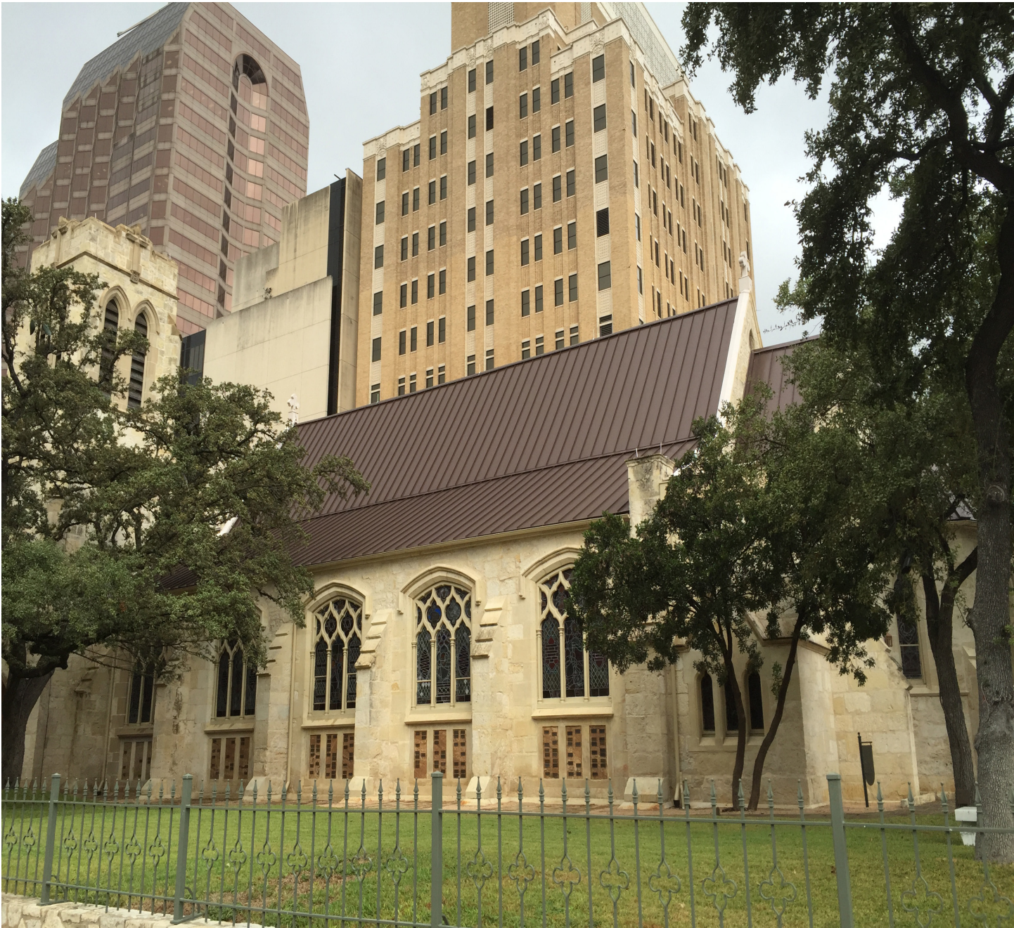
St. Mark's Episcopal Church on October 23, 2015