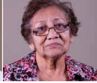
Estella Devora Nursery Staff